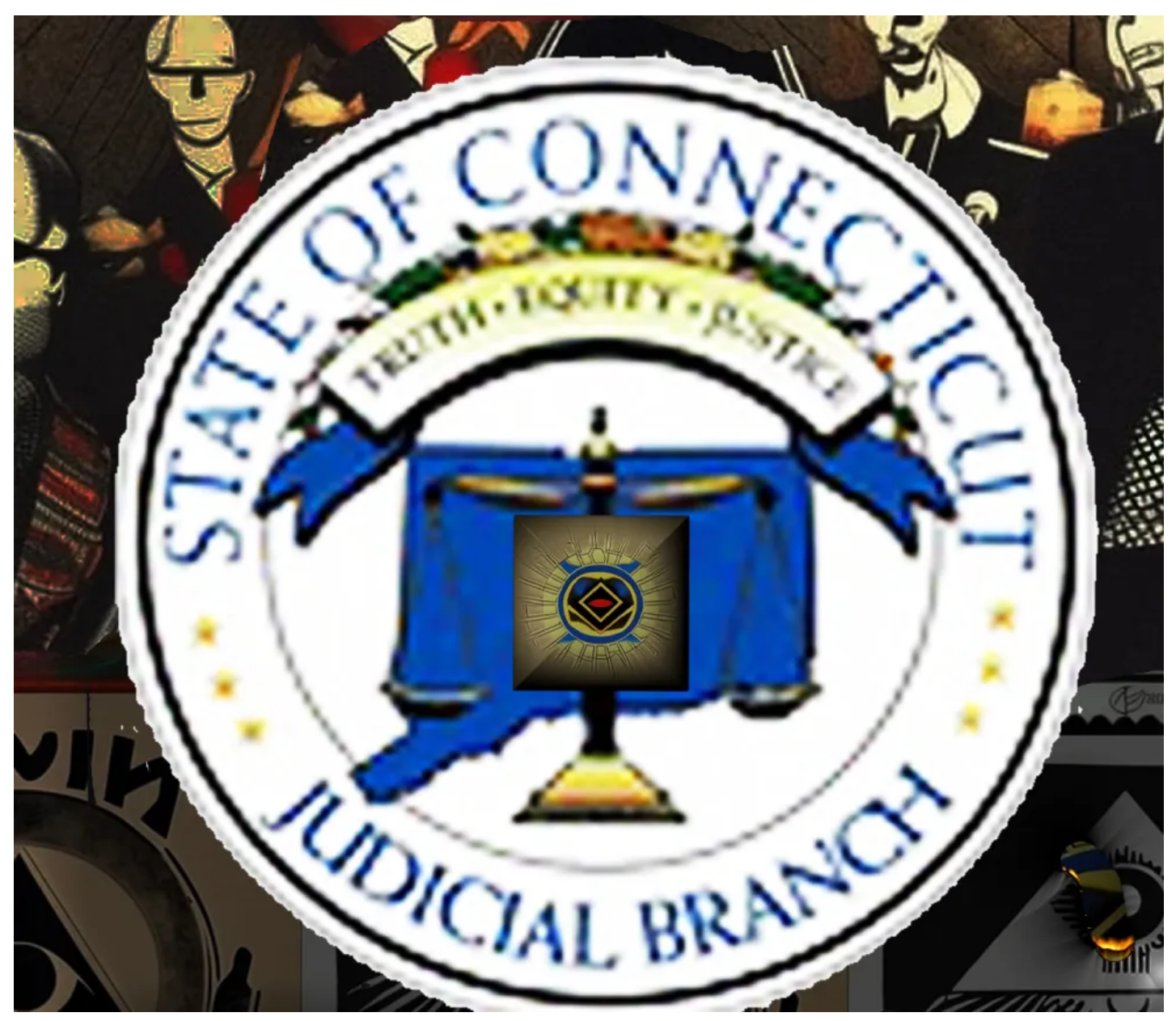
A hoary history - from the burning of witches to the burning of mothers - four centuries of consistency.